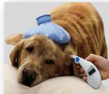
Providing adopters with pet care information, such as pet first aid tips, can assist with a smoother adjustment