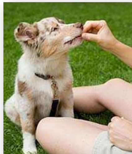
Rehabilitation or training may be needed prior to making an animal available for adoption.

Rescue groups must have a plan in place for animals that need behavior modification or rehabilitation. This means that an animal will not be available for adoption until the issue needing rehabilitation has been addressed by appropriately skilled trainer(s). This may be a foster home that has proven experience in dealing with the issue at hand, it may include medical tests to rule out an underlying medical issue or it may require obtaining professional behavioral assistance.