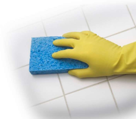
Disinfecting is important to prevent spreading disease.