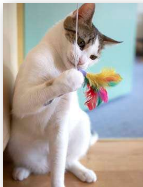
Animals need play and exercise on a daily basis.