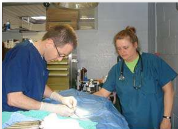
All cats and dogs at least 8 weeks old and two lbs. must be spayed/neutered prior to adoption unless a veterinarian finds conditions to prevent it.

If a dog is found to have heartworm in stage one or two, the dog should be placed on Doxycycline and an anti-inflammatory for two weeks, then sterilized prior to heartworm treatment, unless a veterinarian finds conditions to prevent it. Dogs that have more advanced heartworm disease should be treated for heartworm first, then sterilized six months later. These dogs should remain in foster care or the adoption should not be finalized until the sterilization is complete. If an animal is found to be permanently unhealthy, a letter from a veterinarian must be obtained detailing the animal's permanent health problem that would prevent it from being sterilized.