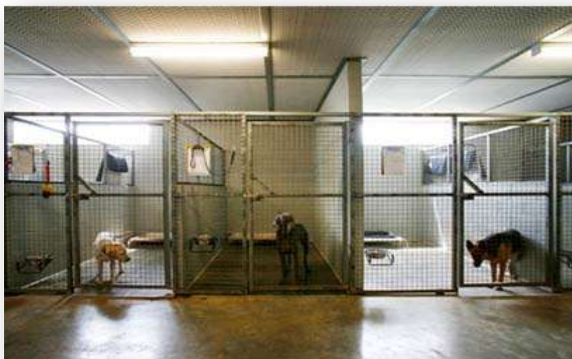
Kennel conditions should be inspected prior to use.