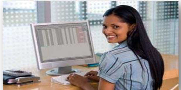
All key personnel can access records stored online.

Best practices are not limited to these digital storage solutions.