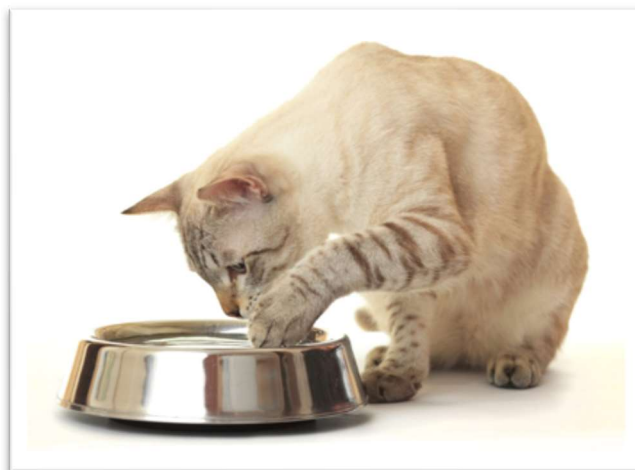
Water must be available at all times.