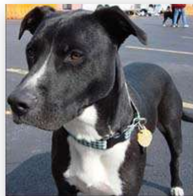
Animals should wear a tag imprinted with the rescue's contact information.