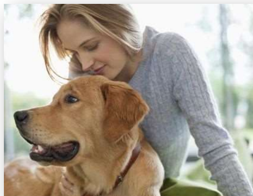
Basic health checks should be performed daily.

Rescues should seek advice and care from veterinary experts, prevent the spread of disease, safeguard the public, including foster homes, and isolate any animal showing signs of having a contagious disease. The rescue should have medical contact information in place for all foster care homes in case of an emergency.